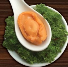
*Premium* Abalone 鲍鱼

Enquiry & Reservation call 6665 8888 or email us at enquiry@yunnangarden.com.sg