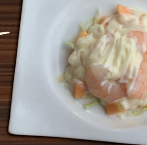
*Popular demand* Salad Prawn 沙拉虾